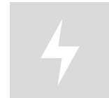
100-240 V AC