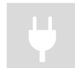
PLUG & PLAY